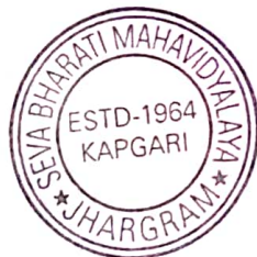
Signature of the Convener

Principal Seva Bharati Mahavidyalaya Kaggari, Jhargram